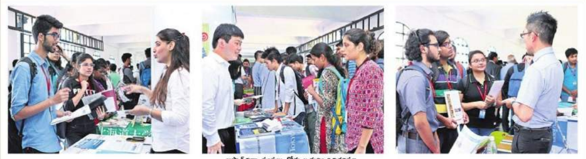
జపాన్ విద్యా సంస్థలు, కోర్సుల గురించి వివరిస్తున్న...

JAPAN HIGHER EDUCATION ITEM PUBLISHED VAARTHA TELUGU DAILY 5.8.2017