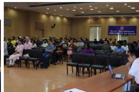
デリー大学北キャンパス(上)