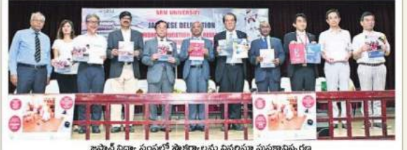
జపాన్ విద్యా సంస్థల్లో సాధనరీతిని అందిస్తున్న పుస్తకావిష్కరణ