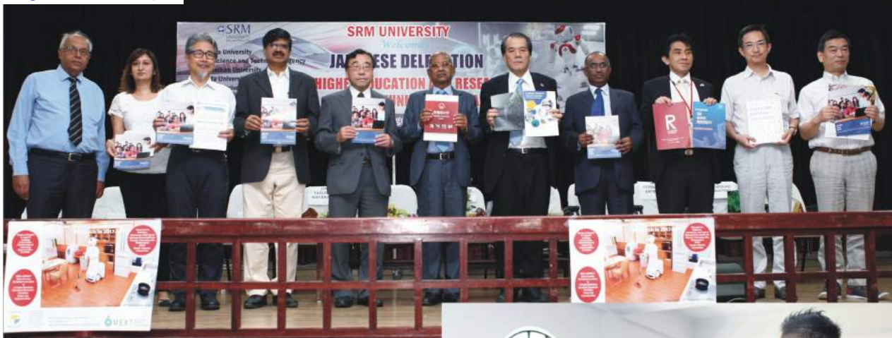
జపాన్ విద్యాసంస్థల్లో ఉన్నత విద్యా కోర్సుల వివరాలతో కూడిన సాధనరీతిని అందిస్తున్న ఎన్ఆర్ఎం, జపాన్ ప్రతినిధులు