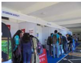
ブースとセミナー風景

SRM大学は東京事務所を設置し、日本との交流を積極的に拡大中です。直近では、早稲田大学が協定を締結しています。