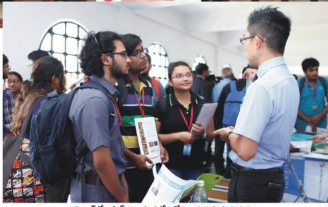
ఫేయిర్లో జపాన్ విద్యాసంస్థల్లోని కోర్సులను వివరిస్తున్న దృశ్యం

JAPAN HIGHER EDUCATION ITEM PUBLISHED VAARTHA TELUGU DAILY 5.8.2017