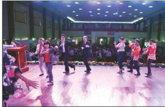
The educational fair underway at BSSS.