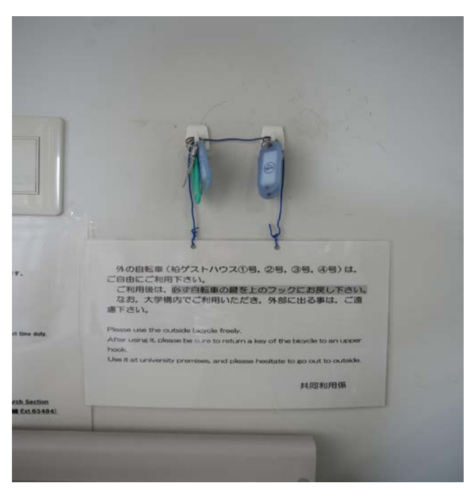
In addition, bikes and umbrellas (a limited number of availability) can be rented for free during your stay at the guest house.