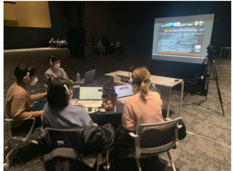
SNU students interacting with UTokyo students (Online Winter Program in 2020)