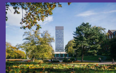
The Arts Tower, the tallest academic building in the UK