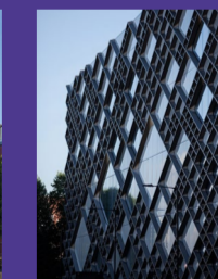
The Diamond, home to state-of-the-art laboratories and creative media suites