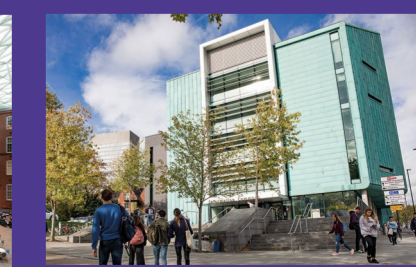
Study anytime in the Information Commons, open 24 hours a day, 7 days a week