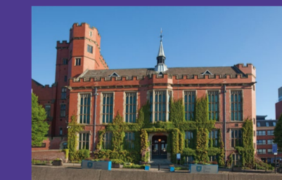
Firth Court, our iconic red brick building

out of 250 universities in Europe for teaching excellence (Times Higher Education Europe Teaching Rankings 2019)