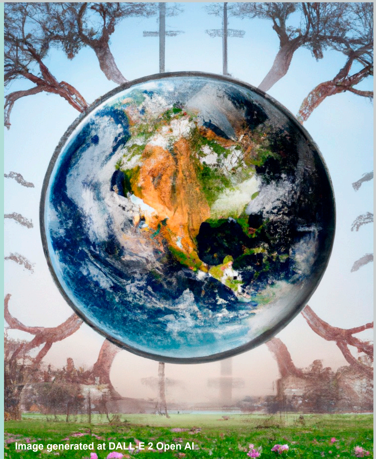
Image generated at DALL-E 2 Open AI