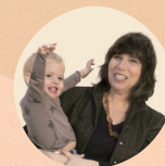
Alison GOPNIK Distinguished Professor, Department of Psychology, University of California, Berkeley