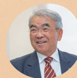
KANADE Takeo U.A. and Helen Whitaker Professor, Robotics Institute, Carnegie Mellon University