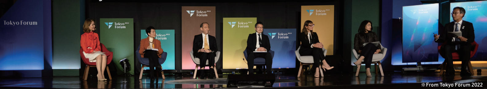
※ From Tokyo Forum 2022

Tokyo Forum is an international conference series that the University of Tokyo created together with the Chey Institute for Advanced Studies of South Korea in 2019, and has provided a meeting place of people, including, but not limited to, those in academia, government, business, NPOs, from all over the world. This year's forum will bring together the expertise of both technological sciences and social sciences, to explore how humanity can respond to the global problems we face today amid social divisions and digital transformation.