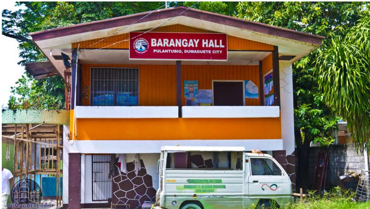
Photo showing a Barangay (village) Clinics for primary healthcare. 1

Consider the local limitations in delivering a practical solution. Your proposal should therefore also discuss approaches to overcoming the barriers for deployment of technology.