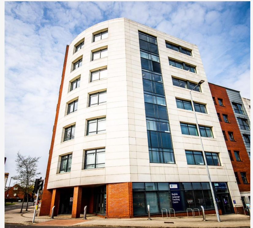
English Language Teaching Centre - Main Building