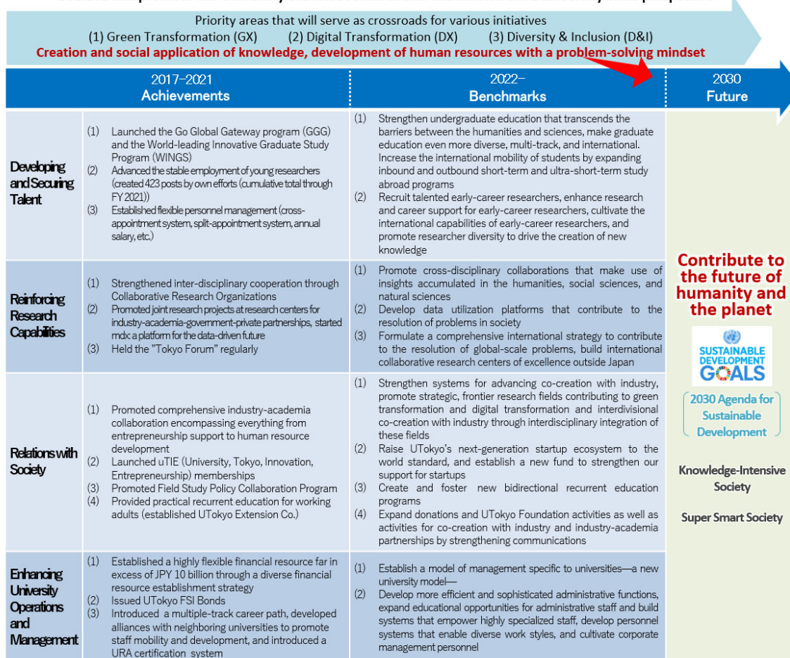
Figure 2. Road Map for Basic Concepts

Oversee and promote the University's diverse research and education from a university-wide perspective